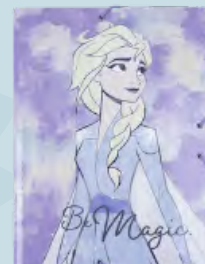
CARPETA ESCOLAR FROZEN ref. 2700000251