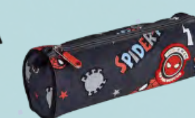
ESTUCHE PORTATODO CILÍNDRICO SPIDERMAN