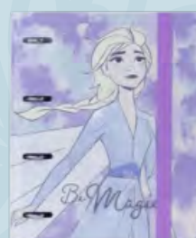
CARPESANO ESCOLAR FROZEN ref. 2700000266