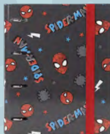
CARPESANO ESCOLAR SPIDERMAN