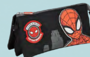
ESTUCHE PORTATODO 3 COMPARTIMENTOS SPIDERMAN