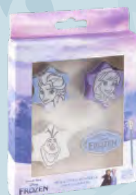
GOMA DE BORRAR PACK X4 FROZEN II ref. 2100003578