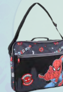
MOCHILA ESCOLAR CARTERONA SPIDERMAN