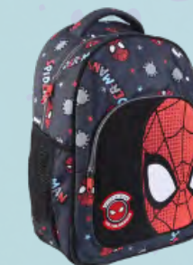
MOCHILA ESCOLAR MEDIANA 42 CM SPIDERMAN