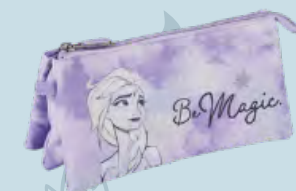
ESTUCHE PORTATODO 3 COMPARTIMENTOS FROZEN II ELSA ref. 2100003844