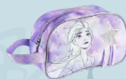
NECESER ASEO VIAJE FROZEN II ELSA ref. 2100003856