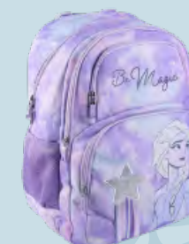
MOCHILA ESCOLAR GRANDE 44 CM FROZEN II ELSA ref. 2100003832