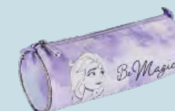
ESTUCHE PORTATODO CILÍNDRICO FROZEN II ELSA ref. 2100003838