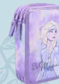
PLUMIER CON ACCESORIOS FROZEN II ref. 2700000384