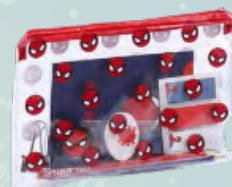
SET PAPELERÍA ESCOLAR SPIDERMAN