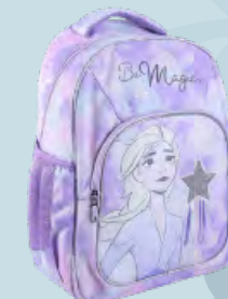
MOCHILA ESCOLAR MEDIANA 42 CM FROZEN II ELSA ref. 2100003826