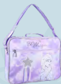
MOCHILA ESCOLAR CARTERONA FROZEN II ELSA ref. 2100003850