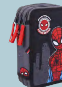
PLUMIER CON ACCESORIOS SPIDERMAN