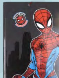
CARPETA ESCOLAR SPIDERMAN